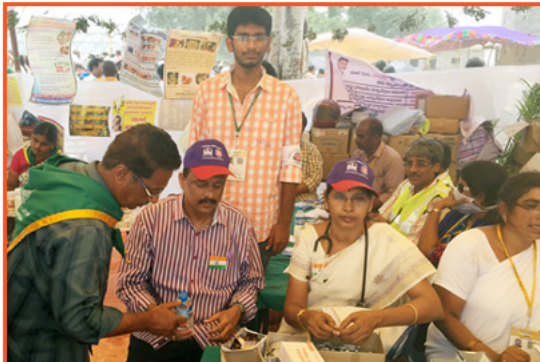
Health Camp at Krishna Pushkaralu