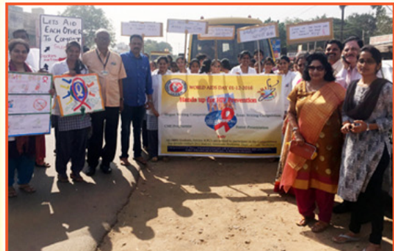
World AIDS Day