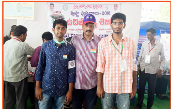
Health Camp at Krishna Pushkaralu