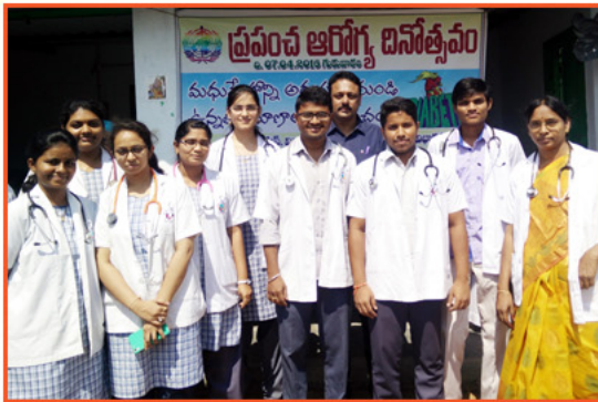
World Health Day