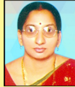
Dr PUMA Member