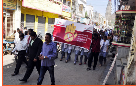
World No Smoking Day